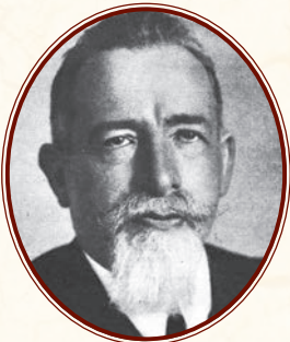
Rabbi Moses Schorr